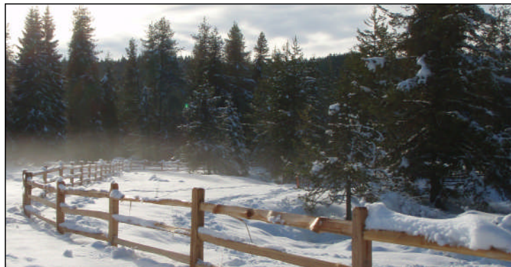
Cattle exclusion fencing installed adjacent to wild steelhead habitat, Corral Creek, Potlatch River Watershed.