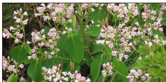
Spreading dogbane ( Apocynum androsaemifolium ), one of over 100 plant species native to the Palouse Prairie.