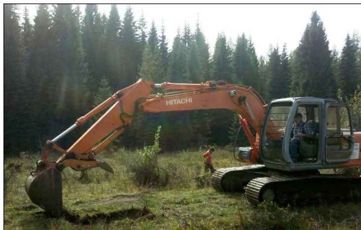
Site of road relocation project intended to reduce sediment inputs to stream. Sedge was harvested from the new road site and used to vegetate ditch plugs which were installed to divert water from degraded, straightened channel to historic channel.